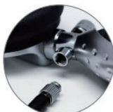
Male and Female connector