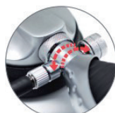
Left and Right hand use