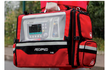
Carrying bag equipped with bracket assembly