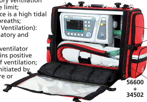
Silicone threaded tube